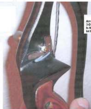
1360: not allowed