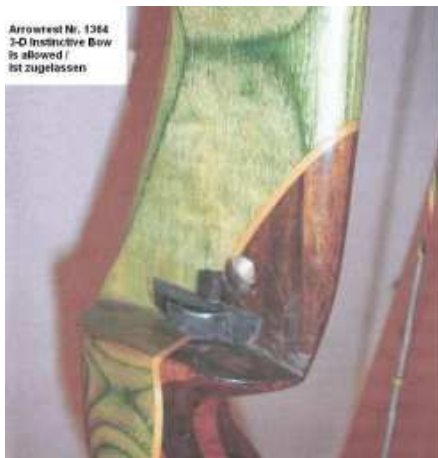
1364: Is allowed

Article 11.10.3.2.2.2 reads: Either no arrow rest is used or only a simple arrow rest without pressure-button and without overdraw can be used.