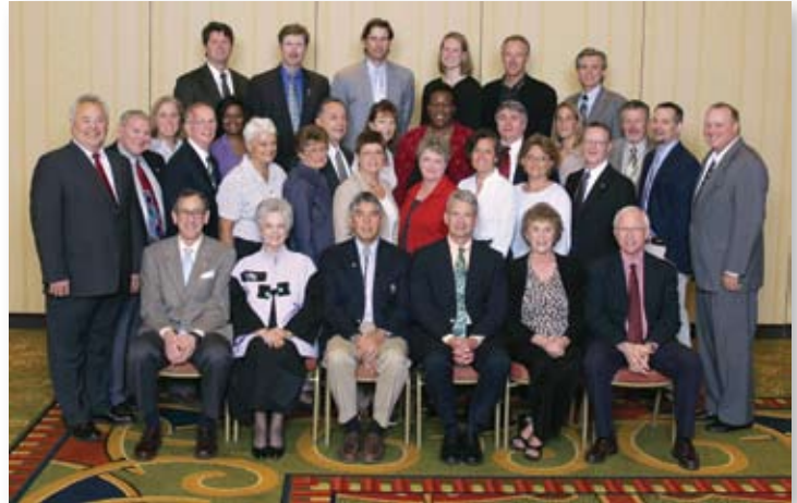
2007 United States Volleyball Association Board of Directors