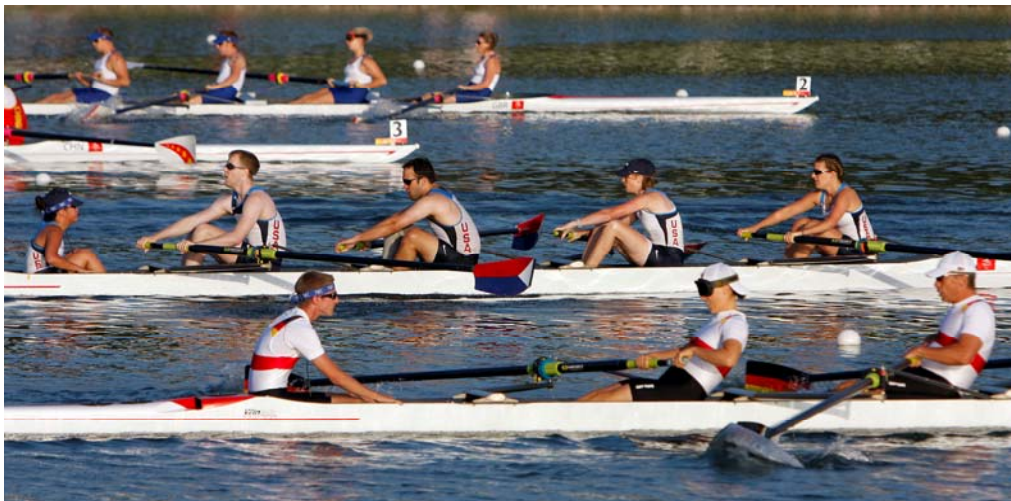
Mixed four with coxswain takes silver for one of the first two-ever medals for the U.S. in Paralympic rowing.

Two U.S. crews made history Thursday at the 2008 Paralympic Games, winning two of the first-ever awarded medals in the sport of rowing. The mixed four with coxswain won silver, while the women's single sculls won bronze to highlight the final day of competition at Shunyi Olympic Rowing-Canoeing Park.